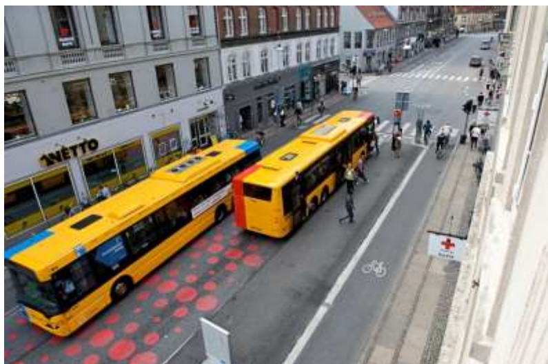
Figure 1 – Engaging and colourful temporary bus-cyclist only road reallocation, Copenhagen

While there is existing use of trials in transport and design practice, the projects referred to here add to and extend this experience. They offer temporary interventions that are more playful and colourful than simple trials, borrowing from the pop up design approach, which draws people in and actively engages them with new uses. They are more obviously temporary and constructed from flexible design elements that can be tweaked (see for example Figure 1).